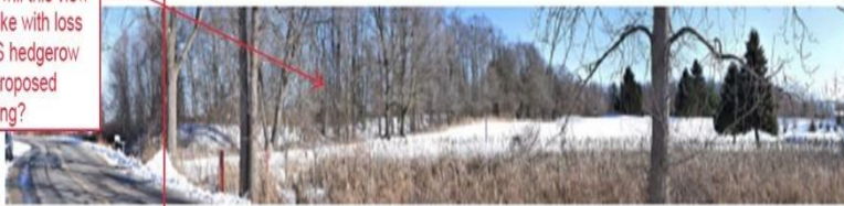
Photo 43: 2129, 2139 Colling Road. Facing Towards Proposed Western Extension.

What will this view look like with loss of N-S hedgerow and proposed berming?