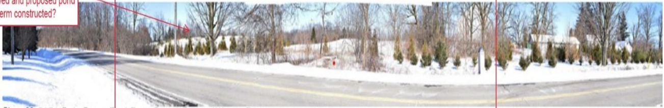
Photo 22: 5050 Cedar Springs Road. Facing Towards Proposed Western Extension.

What will this view look like once hills have been removed and proposed pond and berm constructed?