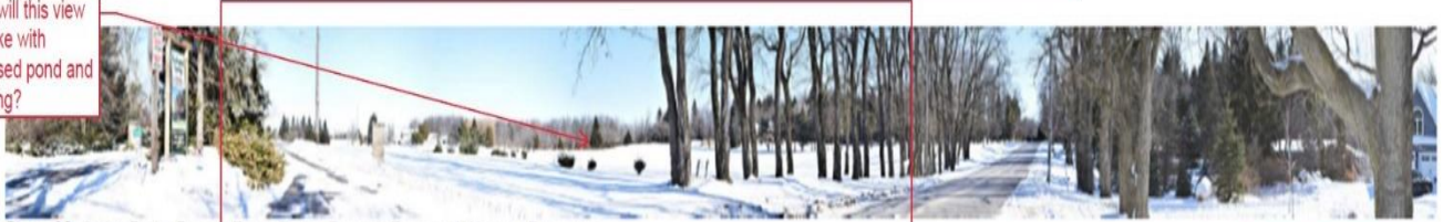
Photo 32: 5234 Cedar Springs Road. Facing Towards Proposed Western Extension.

What will this view look like with proposed pond and berming?